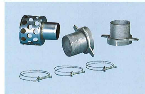
The above picture shows typical samples. Material and design may vary by models.

TOUGH AND POWERFUL PUMP MECHANICAL SEAL is made of silicon-carbide which has most hardness. IMPELLER is made of hi-chrome cast iron. INNER CASING is made of cast-iron and due to stainless steel liner inside inner casing only requires to be replaced when defacing. PUMP CASING, FRONT COVER are made of cast aluminum.